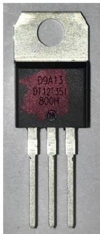
Top view of the sample